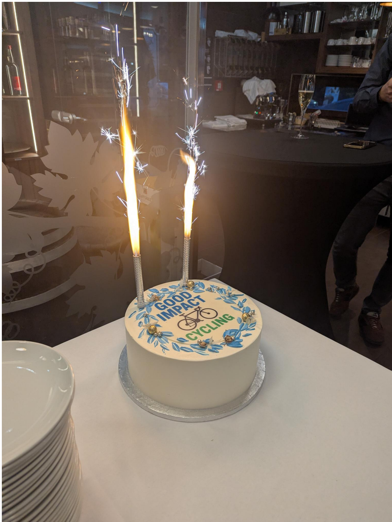
The festive cake celebrating the signing of the Alliance Declaration and the end of the project.