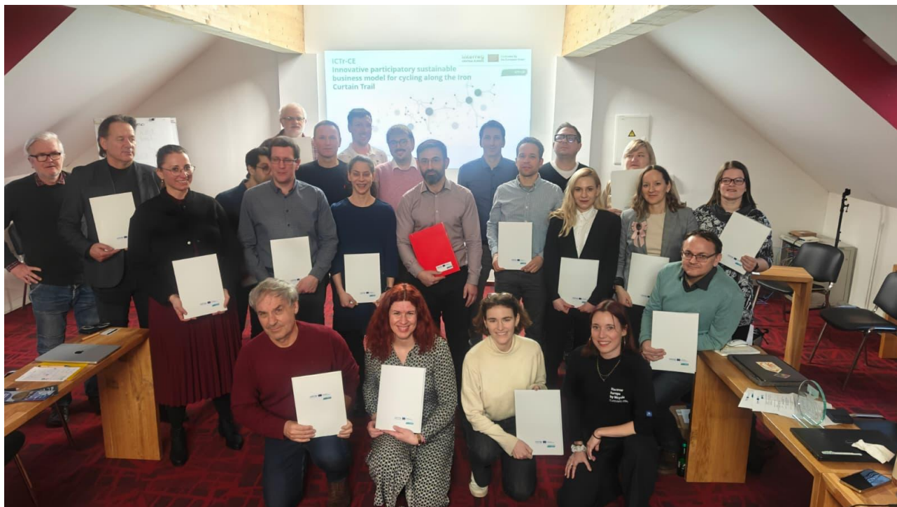
ICTr-CE Project Partners and Associated Strategic Partners pose with the signed ICTr Alliance Declarations.