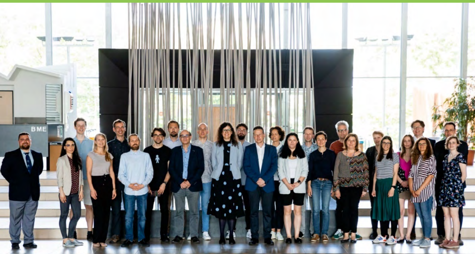
Photo: The Project Team and Programme Officer in the First Partner Meeting.

Within the NiCE project, a wide range of ready-to-use and tested solutions, tools and guidelines have been developed to support the implementation of circular approaches in city centres. These outputs are based on practical experience from pilot cities and are designed to be easily transferable and adaptable to different urban contexts. The key results and tools are presented in this Press Kit, providing a comprehensive overview of how circular lifestyles can be effectively introduced and scaled in cities across Europe.