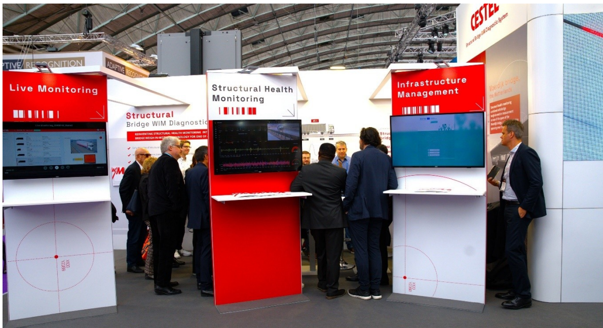
Figure 2: Intertraffic Amsterdam

Link: https://www.interreg-central.eu/event/intertraffic-amsterdam/