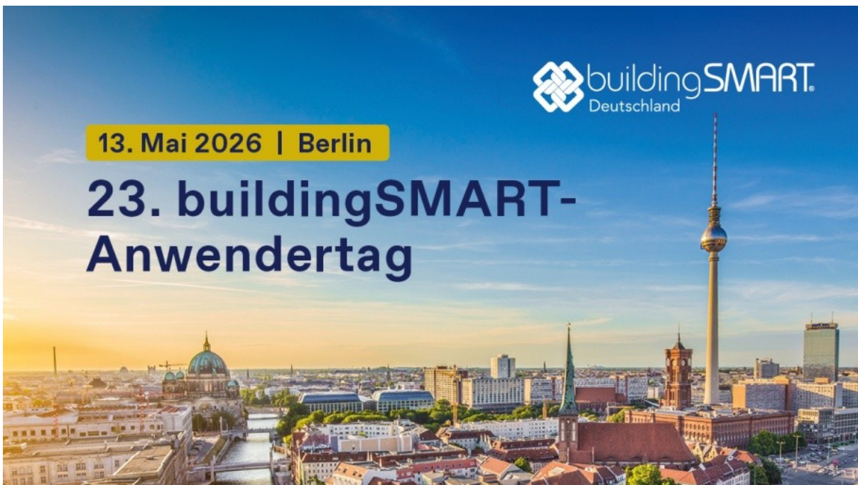
Figure 5: 23rd BuildingSMART Anwendertag

The conference features a full day of technical presentations, practical demonstrations, and discussions on the latest developments in open standards such as IFC, BCF, and other buildingSMART specifications. With approximately 40 expert presentations and several hundred participants, the Anwendertag serves as a key platform for sharing best practices, showcasing innovative digital workflows, and strengthening collaboration across the industry.