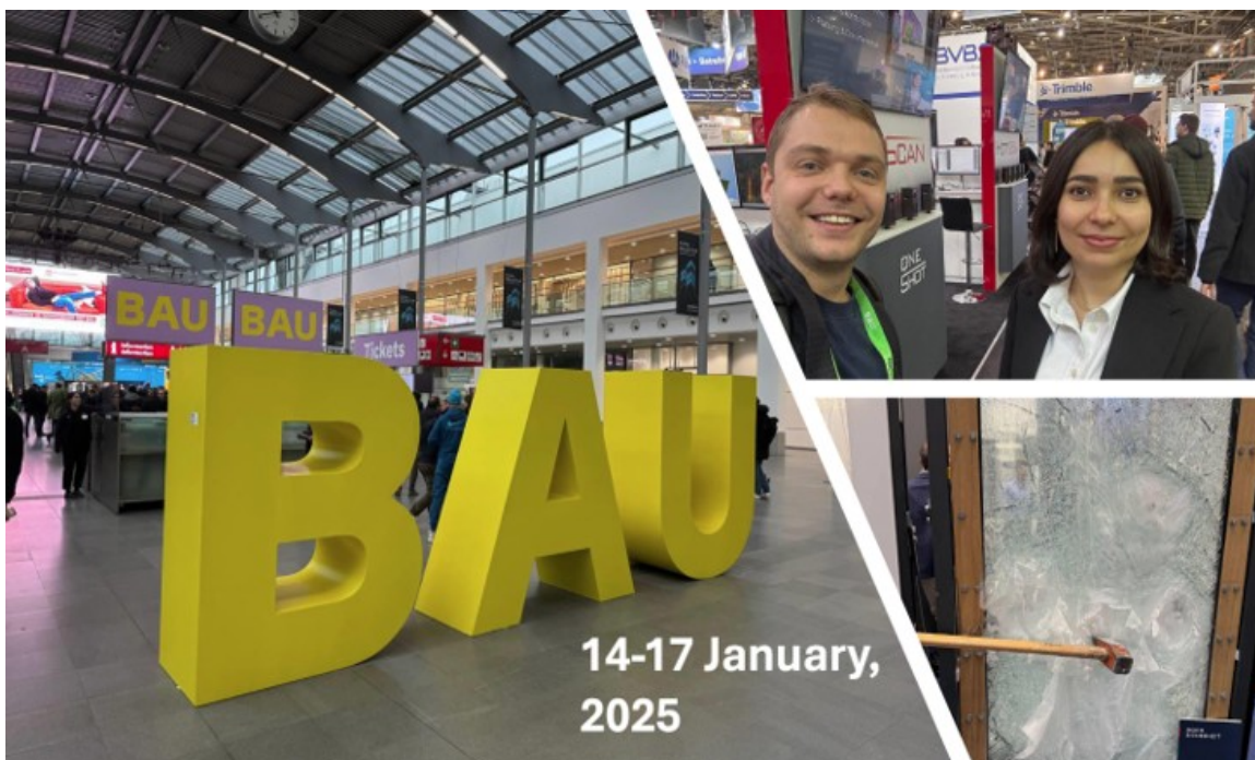
Figure 3: BAU 2025