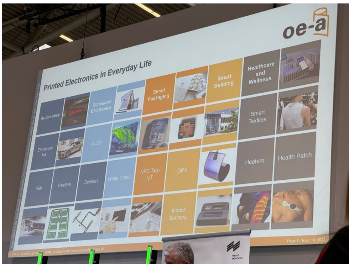
Figure 1: Electronica Munchen

Every two years, the world of electronics meets at electronica in Munich, Germany. As the world's leading trade fair, it presents the industry's entire range of technologies, products and solutions that are paving the way for an All Electric Society (AES). Practice-oriented forums and the world-class electronica Automotive Conference provide in-depth insights into the latest research and application trends - from automation with AI to electromobility and smart energy. More than 3,480 exhibitors and over 80,000 visitors from all over the world in 2024 make electronica the most important meeting place and source of inspiration for the international electronics industry. Electronica took place from November 12–15, 2024. TUD participated in this event and disseminated BIM4CE material to stakeholders.