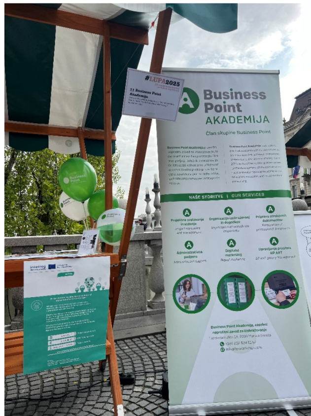
Figure 6: Lupa Festival in Ljubljana

Participation in the LUPA 2025 Festival contributed to increased visibility of the BIM4CE project, strengthened its external communication, and facilitated networking with organizations and individuals active in the fields of sustainable development, innovation, and social progress. The event thus represented an important opportunity to present the project to a wider audience and to enhance its societal impact.