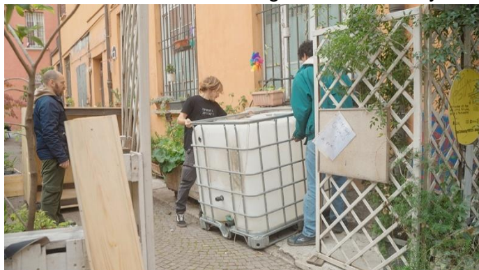
Figure 3 Rainwater collection tank being installed in Bologna.

Heat, drought and water shortages shed light on the problem of water scarcity especially in summer but it is in the cold seasons that we have a greater possibility of doing something to prevent the problem.