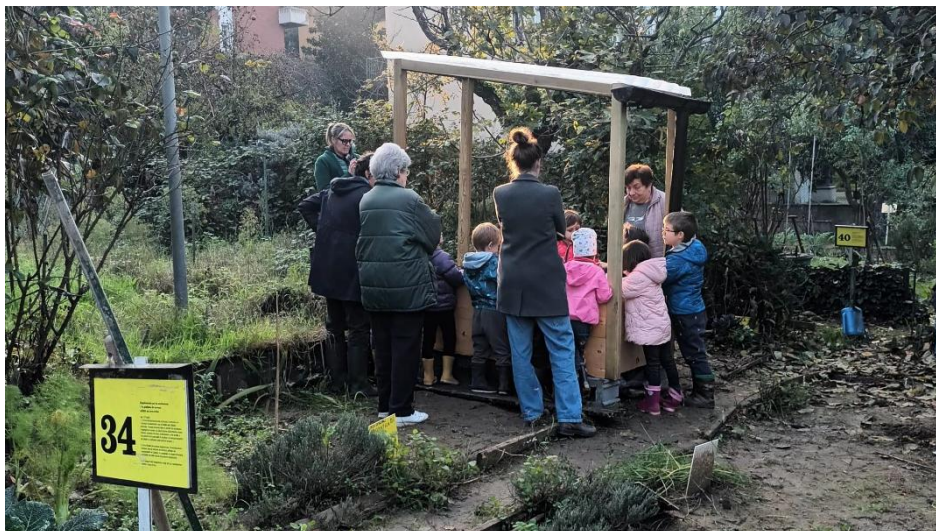
Figure 2 The wicking bed installed at the Porta Saragozza municipal gardens.

three solutions for a more circular and efficient use of water for urban farming (a rainwater tank with phytoremediation, a wicking bed, i.e. a raised bed with a water collection tank under the soil, and a hydroponic growing tower). In the final meeting, the three solutions were built and handed over to three citizen groups (co-housing residents, a community gardening association, and a group of researchers and students from the University of Bologna, respectively). In the following months, the three groups of citizens tested the solutions, monitored their water consumption, and assessed the water savings, also with the help of experts. In June 2025, the entire experience was shared at a public event that marked the formal conclusion of the NiCE pilot activities in Italy. However, the installations remain available to the local community and its citizens, and their continued use is already planned, for example for educational purposes in municipal gardens and for research at the University.