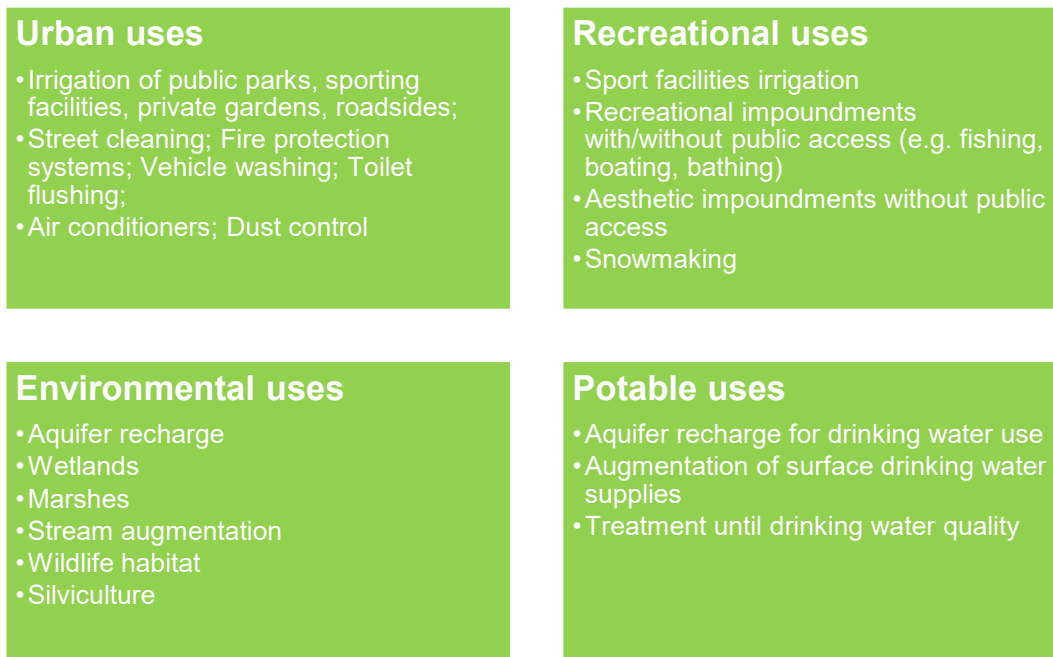
Figure 1 Reclaimed water applications relevant in cities. Own reproduction based on "Water Reuse in Europe" (2014).

Figure 1 highlights reclaimed water applications relevant for urban areas based on the report by the Joint Research Centre (JRC) titled "Water Reuse in Europe" (2014).