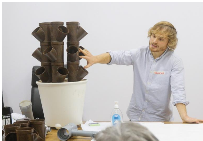
Figure 5 Home hydroponic kit presented during a workshop in Bologna.

A solution, not only in terms of space but also of water saving and production efficiency, is vertical hydroponic cultivation which allows you to grow even 20-30 plants in a limited space such as a small balcony and with minimal water consumption.