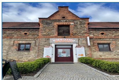
Photo 2 - accessible entrance