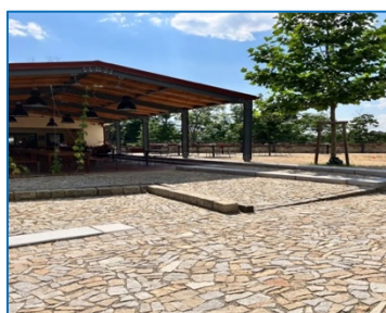
Photo 3 - detail of outside seating