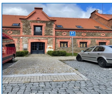
Photo 2- public parking spaces