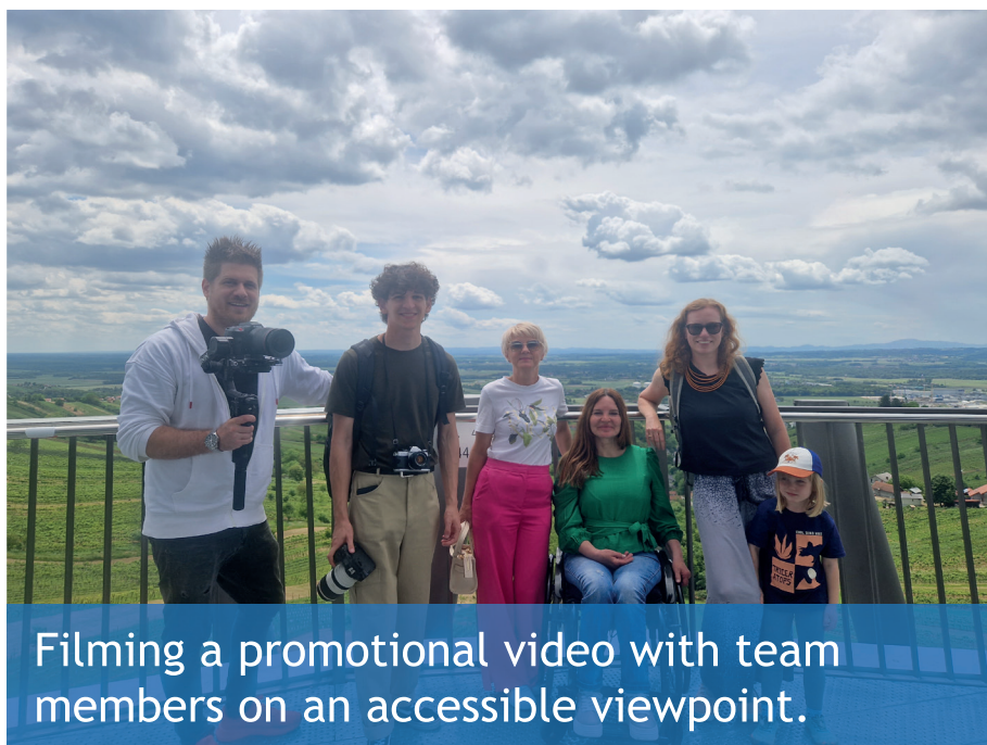
Filming a promotional video with team members on an accessible viewpoint.

A joint pilot action with Croatia, Hungary, and Slovenia produced a short promotional video highlighting the accessibility of the cross-border Pannonian region. The video production provided an opportunity to engage with management teams, discuss accessibility improvements, and plan distribution. It will be shared through tourism providers' and organisations' websites to raise awareness and promote inclusive travel in the region.