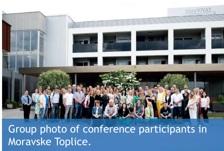
Group photo of conference participants in Moravske Toplice.