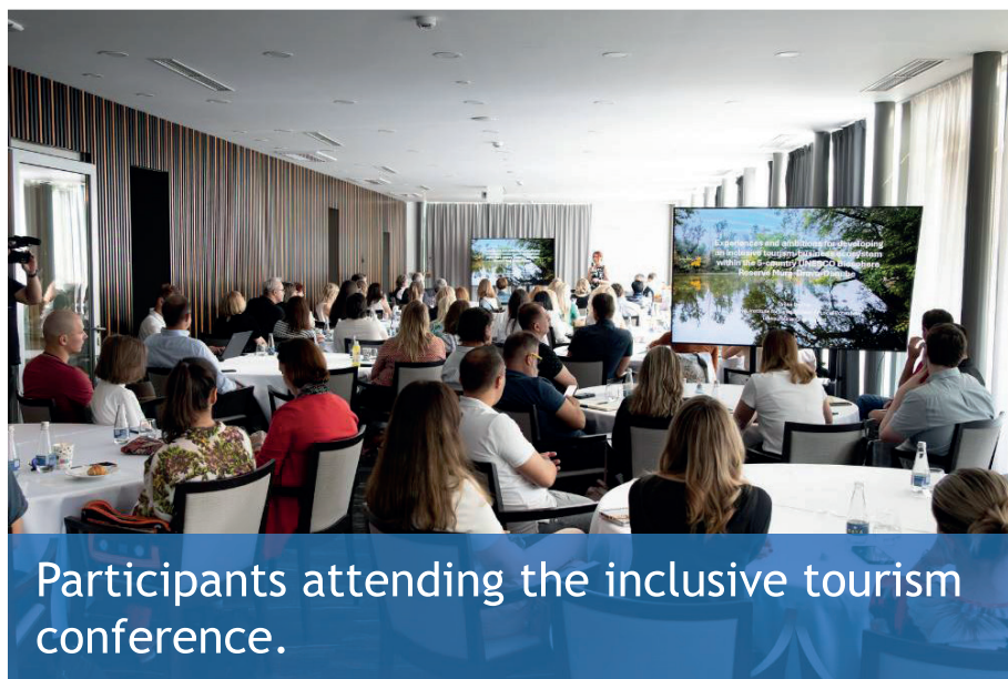
Participants attending the inclusive tourism conference.

The international conference held in Moravske Toplice in June 2025 brought together many experts, stakeholders, and project partners to explore how accessible tourism can drive sustainable development, create new investment and tourism opportunities, and strengthen cooperation between countries in the region. The event also showcased inclusive tourism as a key development and investment opportunity and united multiple Interreg Danube projects in a collaborative format.