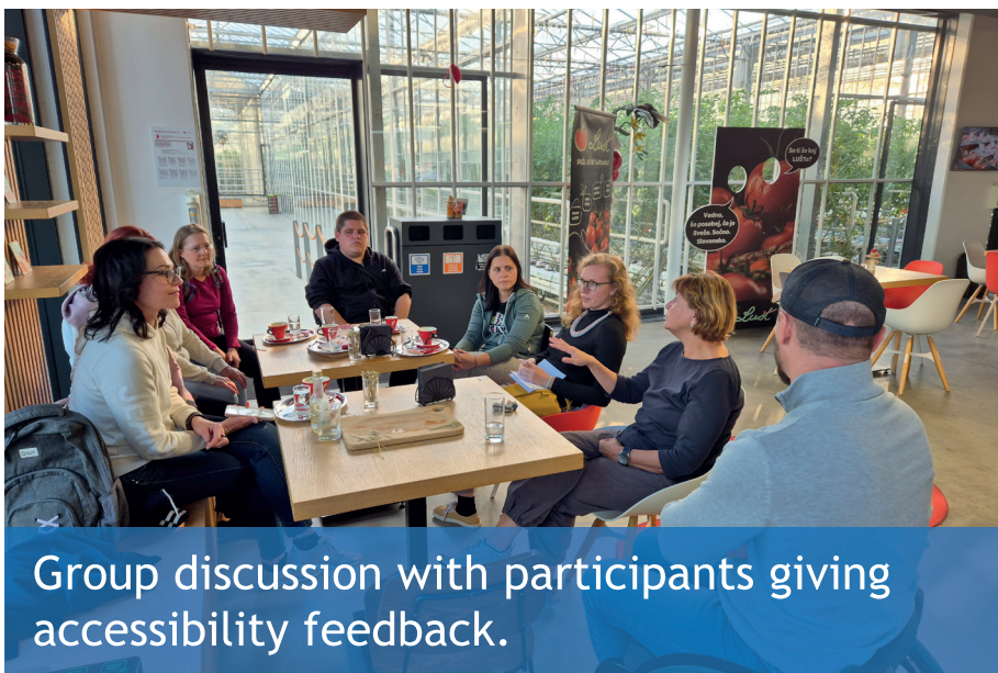
Group discussion with participants giving accessibility feedback.