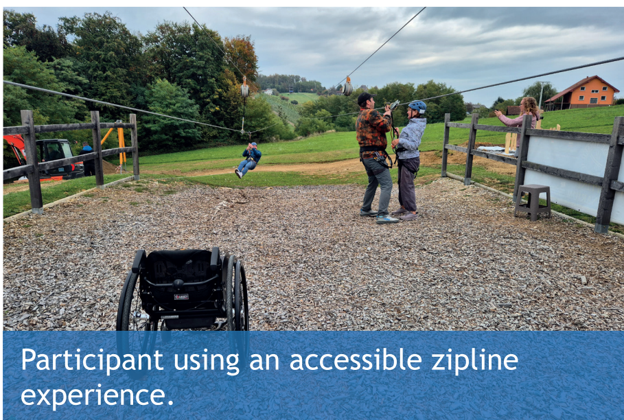
Participant using an accessible zipline experience.