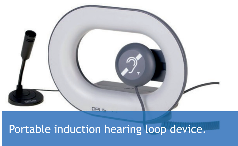
Portable induction hearing loop device.

Following an accessibility assessment of Slovenian tourism sites, it was found that most facilities lacked induction loops for deaf and hard-of-hearing visitors . To improve access, six portable hearing loops were purchased to health centres and hospitals in the pilot area, identified in cooperation with local association for the deaf and hard of hearing. The official public handover of the equipment presented an excellent opportunity to engage local media and to raise awareness of this important topic.