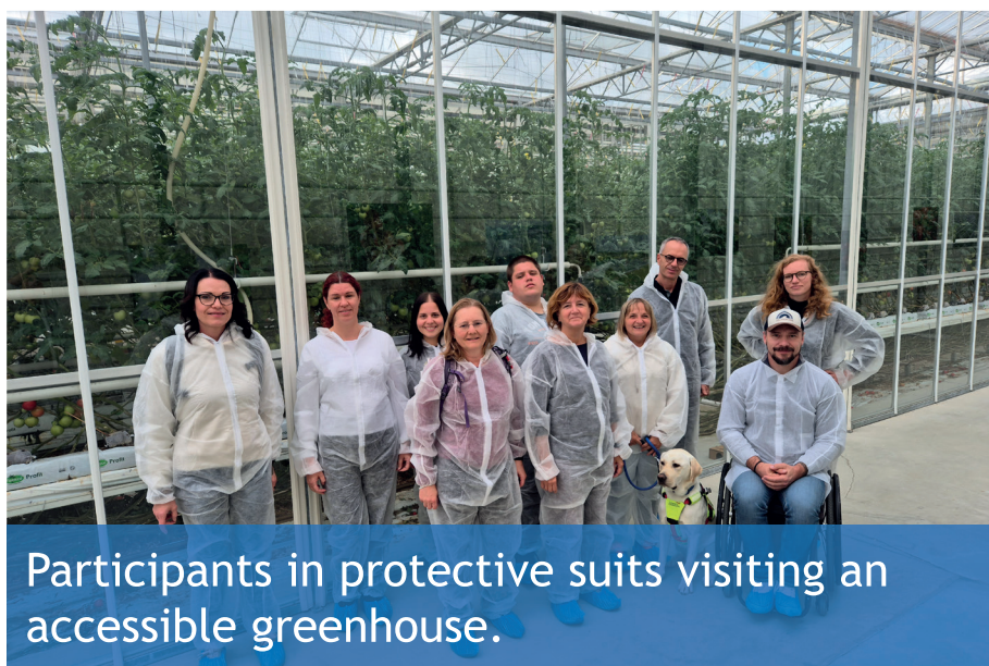
Participants in protective suits visiting an accessible greenhouse.