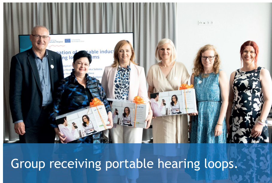
Group receiving portable hearing loops.

Following an accessibility assessment of Slovenian tourism sites, it was found that most facilities lacked induction loops for deaf and hard-of-hearing visitors . To improve access, six portable hearing loops were purchased to health centres and hospitals in the pilot area, identified in cooperation with local association for the deaf and hard of hearing. The official public handover of the equipment presented an excellent opportunity to engage local media and to raise awareness of this important topic.