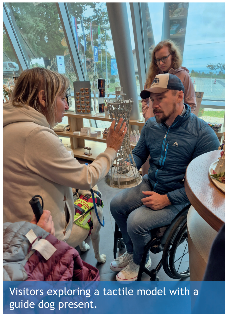
Visitors exploring a tactile model with a guide dog present.