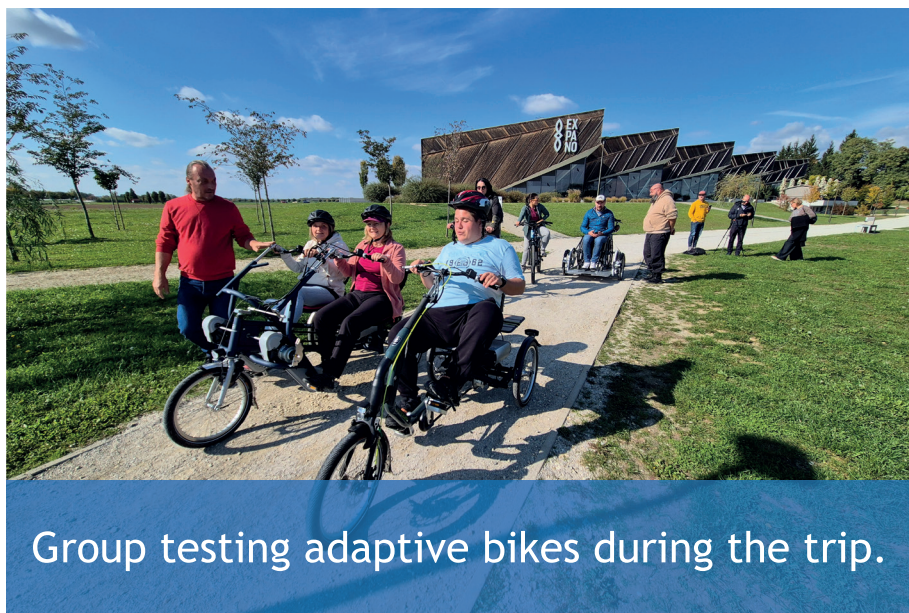
Group testing adaptive bikes during the trip.