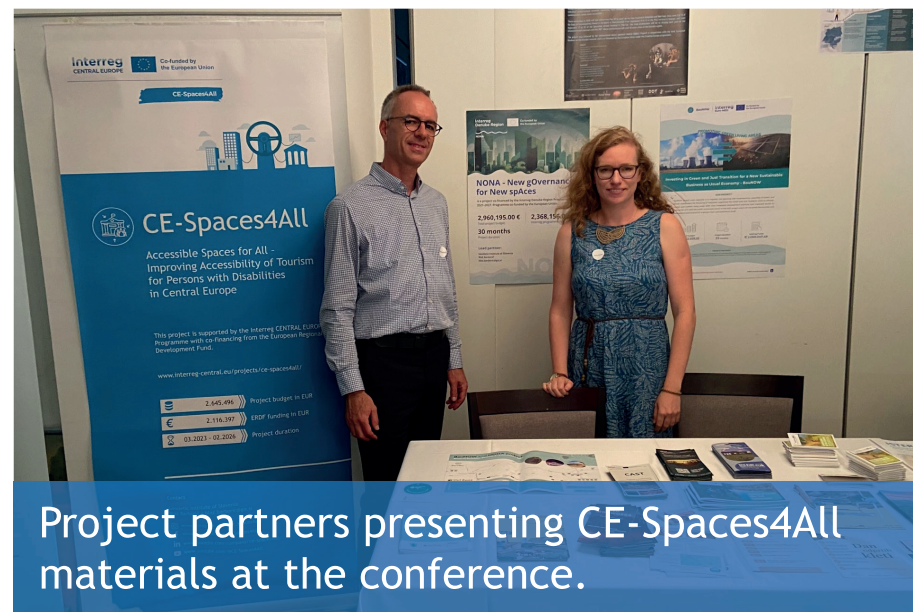
Project partners presenting CE-Spaces4All materials at the conference.