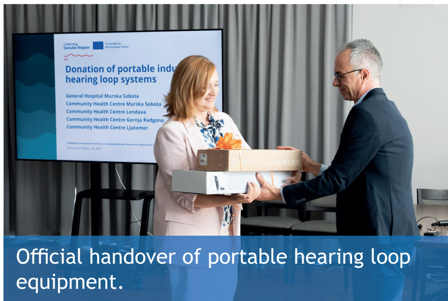
Official handover of portable hearing loop equipment.