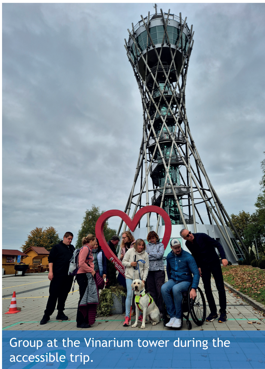
Group at the Vinarium tower during the accessible trip.