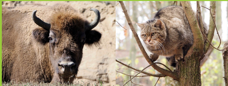
Endangered Species Pilot Actions