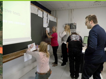
Solutions for Better Connectivity in EGB

➔ Enhanced Connectivity, Improved Habitats, Active Stakeholder Network