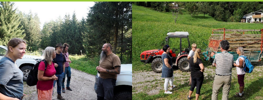
Integration of Stakeholders & Scientific Experts