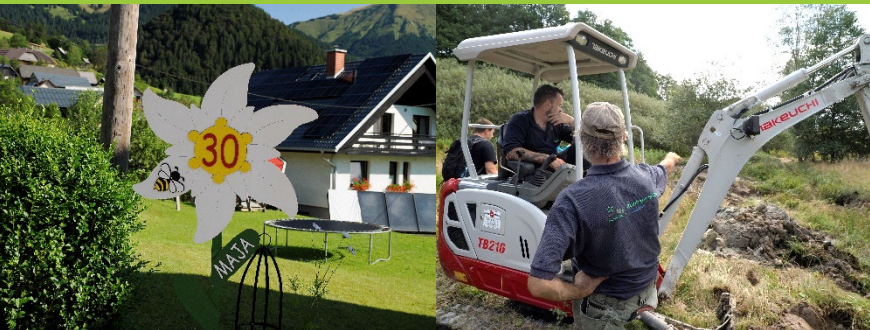
Habitat Restoration Pilot Actions