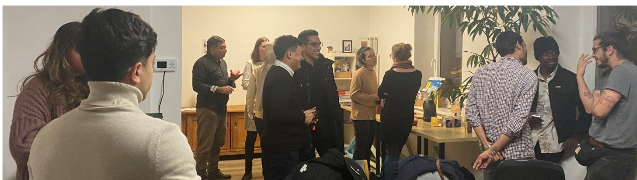
February ISIHUB meeting in Germany