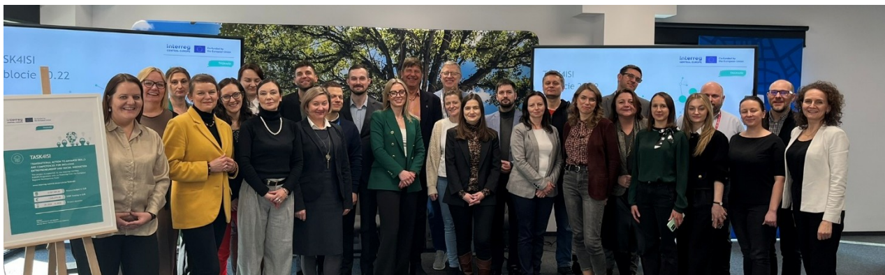
The 2nd ISIHUB meeting in Krakow: link to blog