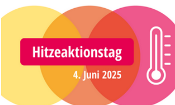
Picture: Hitzeaktionstag 2025