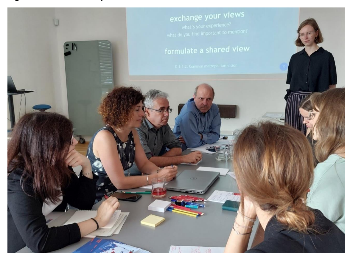
Figure 6.1. Focus Group discussion in Brno