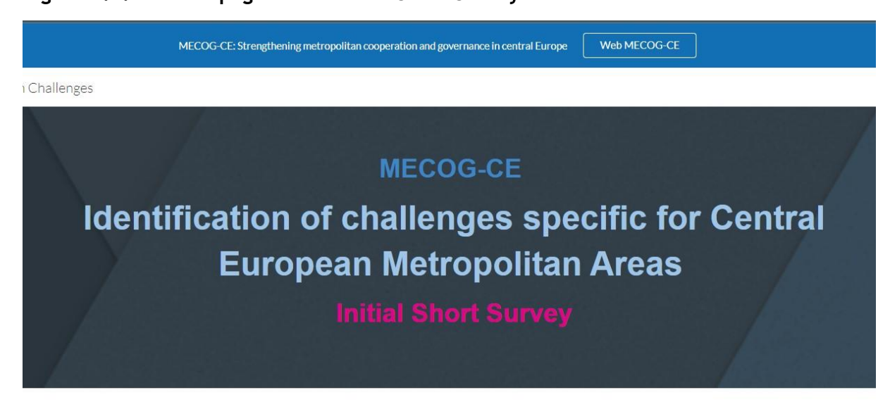
Figure 5.1. The webpage of the Initial Short Survey

This online survey aims to gather information on <u>challenges related to metropolitan dimension</u> (metropolitan development, governance, planning, and cooperation). We are particularly interested in the perspectives and discussions within MECOG-CE partner metropolitan areas, as reflected in their strategies, policies, and decision-making processes.