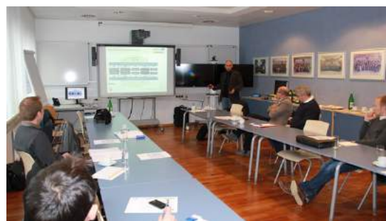
HARTBERG/PINKAFELD 1 st TRAINING Mentoring partner: CyberForum, GE