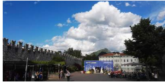
SIAMO EUROPA FESTIVAL Trento, Italy