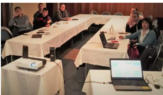
VAS COUNTY 1 st TRAINING Mentoring partner: Informatica Trentina, IT

All 5 core team training workshops were completed in the 2nd project period: the last two, in Kielce and Kosice region, on May 30th and 31th, by the mentoring partner e-Zavod. The second round is planned to be at latest by the end of September 2017.