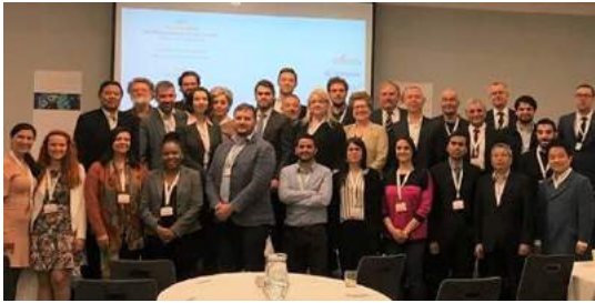
MOBILE GOVERNMENT WORLD SUMMIT Brighton, United Kingdom