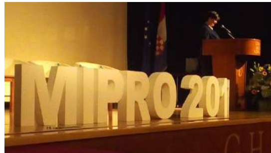
MIPRO 2017 Opatija, Croatia