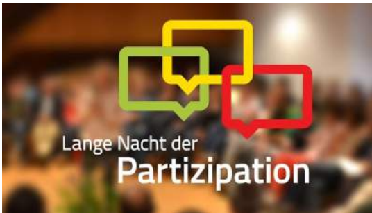
LANGE NACHT DER PARTIZIPATION Dornbirn, Austria