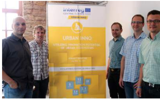
2 nd Mentoring workshop for Hartberg/Pinkafeld Core team