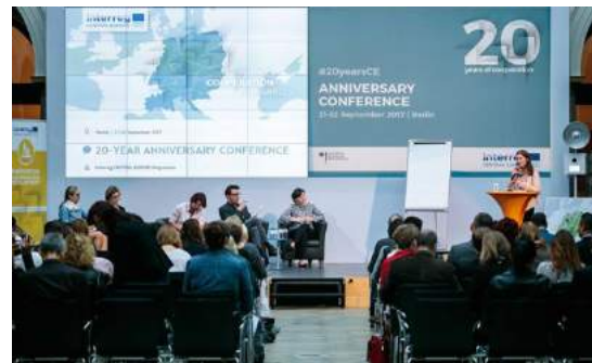
Interreg CE Annual Conference 2017