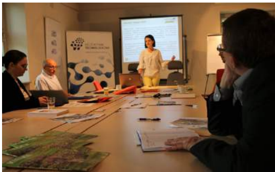
1 st Training workshop for Kielce core team