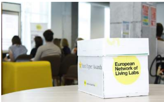
Workshop at Opelivinglab Days 2017