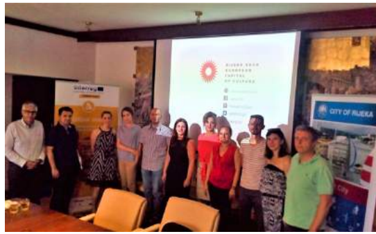
2 nd Mentoring training Rijeka - CyberForum