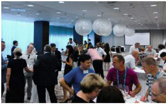
WIRE - Week of Innovative Regions in Europe 2017

Project partners presented URBAN INNO to various audiences on several public occasions. Hope that we've inspired someone to move towards urban innovation and citizen participation.