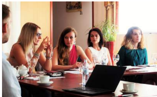
Maribor - Košice 1 st mentoring training