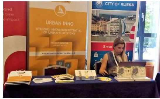
Step into digital future: Major Cities of Europe 2017