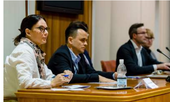
E-participation of citizens in Slovenian municipalities