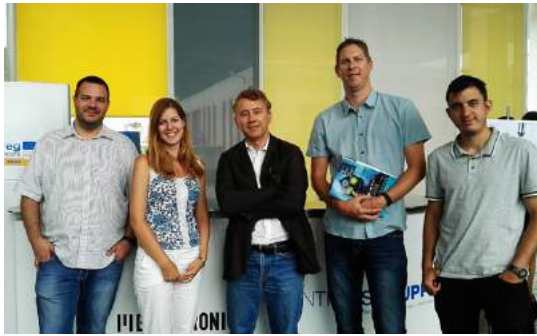
Vas County Core team 2nd workshop in Trentino province