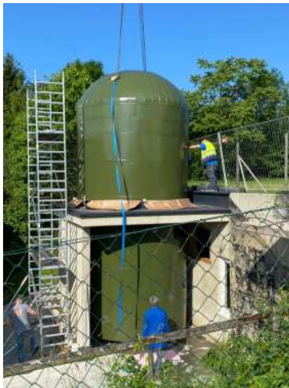
Last work during the storage installation