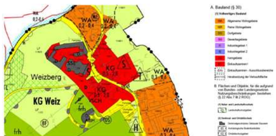
Excerpt from the zoning plan for the focus area Weizberg (Source: zoning plan No. 1.0 - Stadtgemeinde Weiz, as at: 26.09.2019)

In this context, the area of the heating plant in the historical city centre of Weizberg is located in a monumental protected area according to the zoning plan. In Austria, the protection of historic sites and monuments in historic urban centres or other districts is subject to the Building and Regional Planning Act of the Federal State and the Austrian Monument Protection Act. In this context, a local image expert in the context of building permits performs the preservation of the local image and of historical monuments in the respective local image protection zones. Structural changes in protected areas therefore require a building permit including a positive assessment of the protected area.