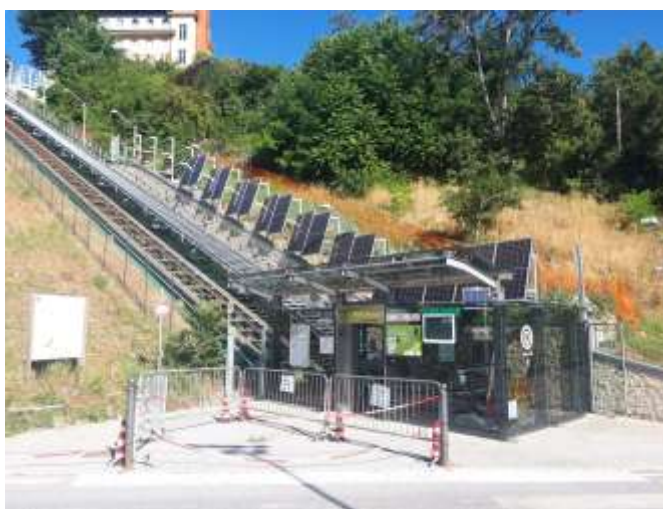
The PV plant installed at the sloping elevator in Cuneo

The integration of the new system for power self-generation from the photovoltaic field required the support of the experts. This particular procedure, outsourced to Studio di Ingegneria Brignone from Cuneo, took several months. In addition, an internet connection was installed for the download of the monitoring data collected by the system. Also this operation, carried out by the Data Processing Sector of the Municipality of Cuneo, was rather time consuming due to the summer holiday season that slowed down the operations.