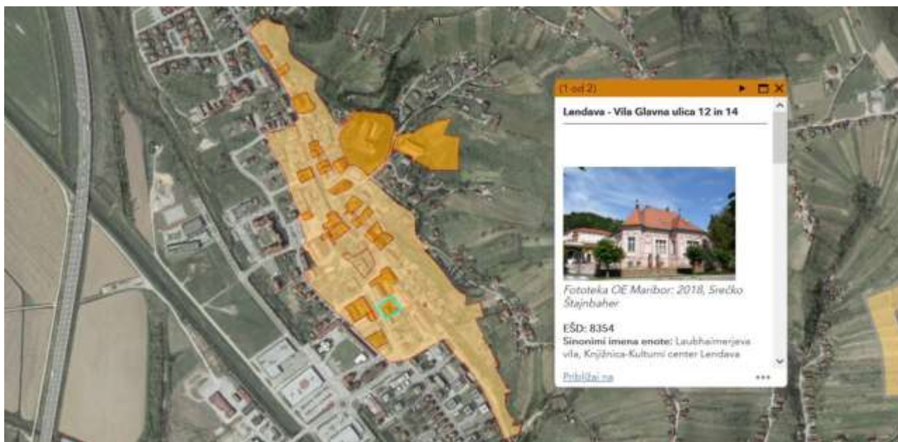
The location of Public Library in Lendava

The Lendava Library is located in the centrum of the town near the Evangelical Church and the Lendava Town Hall, where the municipal administration is located.