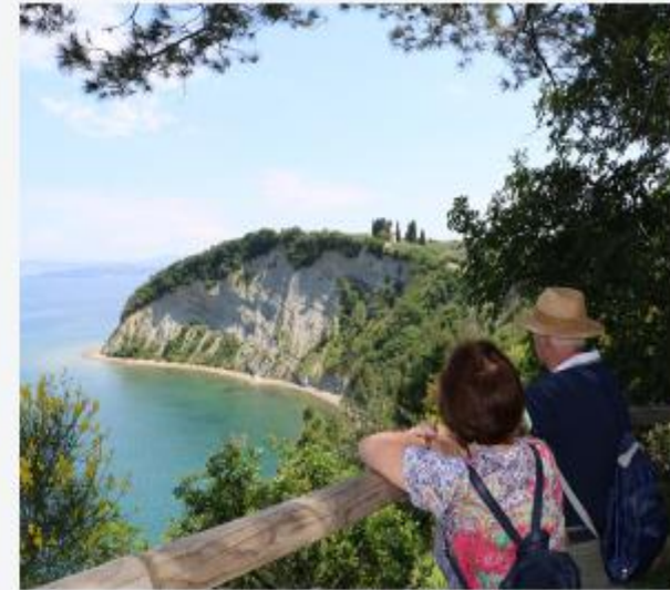
The Importance of the Buffer Zone