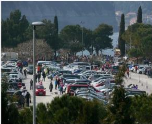
Massive Tourist Flow