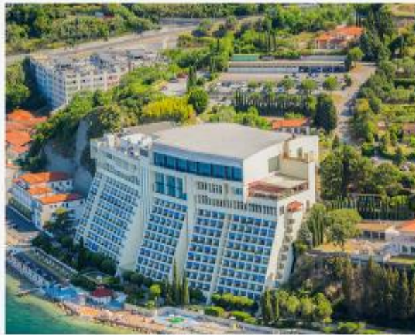
Potential Landscape Degradation: