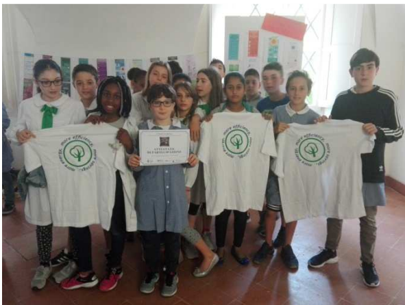
Training activities in Italy

Our Project Partners have organized various events connected with training sessions for Seniors and also Juniors during 2017/2018 school year. See our photo - report