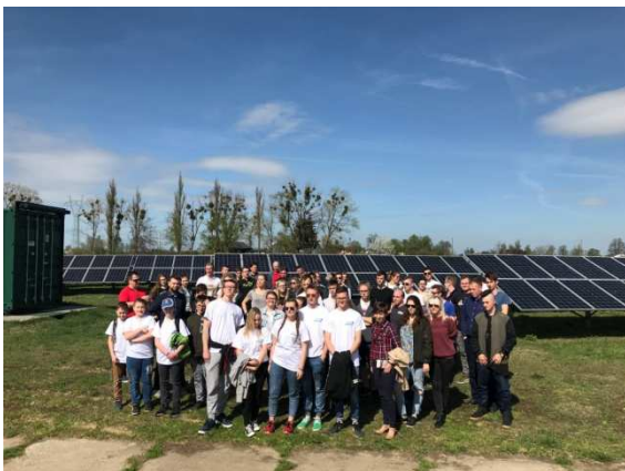
Study visit in Bydgoszcz, Poland