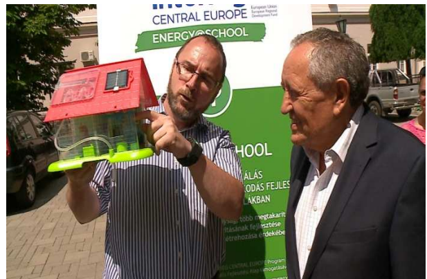
Training activities in Szolnok, Hungary