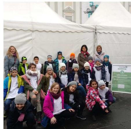
Juniors from Klagenfurt