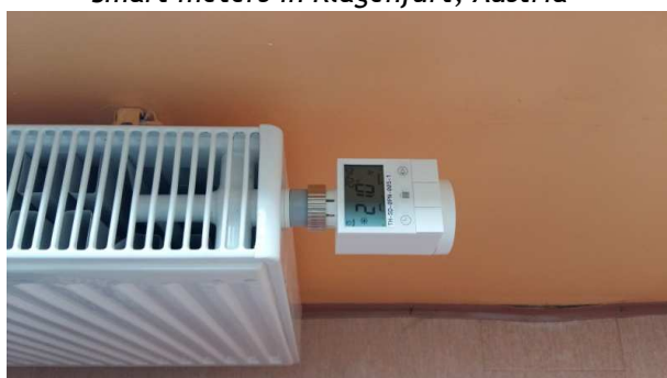
Thermostatic valves in Celje, Slovenia

Some of Partners have already installed smart meters system and devices in involved schools. They assist school staff and students in every day energy monitoring and helps encourage them to save energy also in their houses. Look at the 1 st photo report.