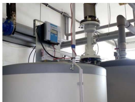
Smart meter in Ujszilvas, Hungary