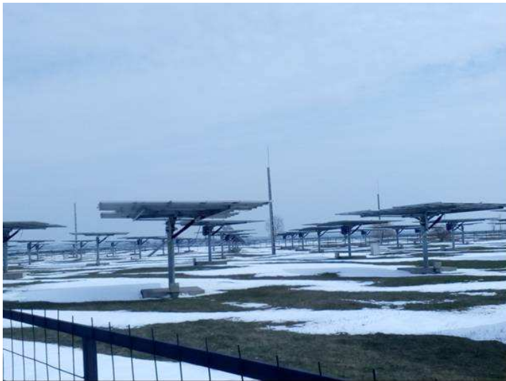
PV plan in Ujszilvas