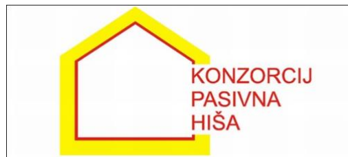
Figure 6: Official logo of the initiative

It is an informal association of institutions, companies and professionals who, through their activities, promote and facilitate the construction of passive houses (heating energy consumption up to 15 kWh/m 2 a) and better low-energy houses (heating energy consumption of 15 kWh/m 2 a) to 30 kWh/m 2 a). The main task is to connect scientific, professional institutions and companies that are offering the possibility of constructing or remodelling passive houses through their activities with potential investors.