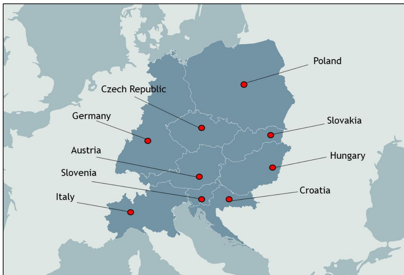
Figure 1: The nine countries of the Central Europe Region 4

According to the INTERREG Central Europe Funding programme, nine countries in the European Union form the Central Europe region. They are displayed in the following figure.