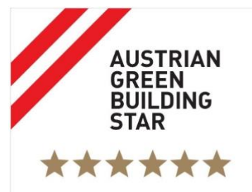
Figure 3: Official logo of the Austrian Green Building Star

The rating of the certification system "Austrian Green Building Star" provides for 4 to 6 stars: